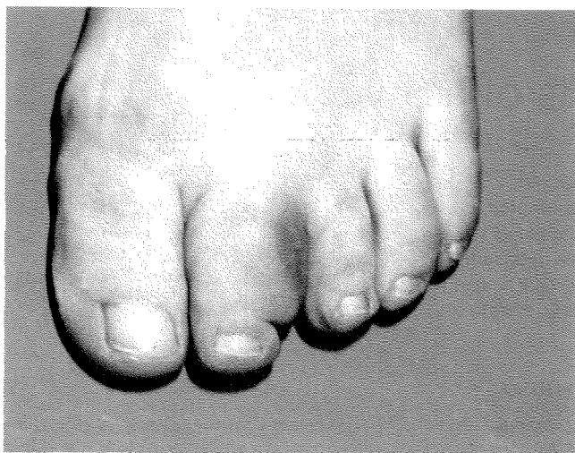
Figure 1. Painful swelling of the second toe of the left foot in a 49-year-old woman.